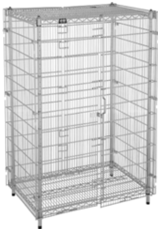
SC2436-48C Stationary Cage